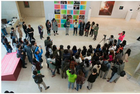
“Myths and Facts of Rape” Call and Response during Half the Sky: Intersections in Social Practice Art Luxun Academy of Fine Arts, Shenyang, China, 2014