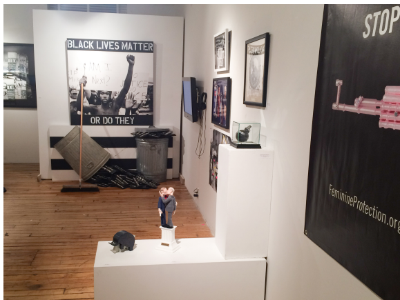
Install shot, What's Right, What's Left: Democracy in America

During the opening for our What's Right, What's Left: Democracy in America exhibition in January 2016, a Turkish man introduced himself to me. He was visiting his daughter, who was studying in the city and, because he was so distraught about the state of democracy or lack thereof in his country, he needed the solace of being in a safe place where democracy was being talked about and analyzed. He was not an artist but told me how comforting it was that we had that space to share our concerns and feelings about what is right and what is wrong in government. That brief conversation made the world seem like a smaller, kinder place, where strangers feel safe enough to reach out to each other for a bit of solace.